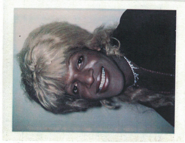
POLAROID BY ANDY WARHOL

WITH HER CLOSE FRIEND, + FELLOW TRANSGENDER DRAG STAR, SYLVIA RIVERA, MARSHA FOUNDED S.T.A.R. (STREET TRANSVESTITE ACTION REVOLUTIONARIES) IN 1970, AN ADVOCACY GROUP FOR YOUNG TRANSGENDER PEOPLE.