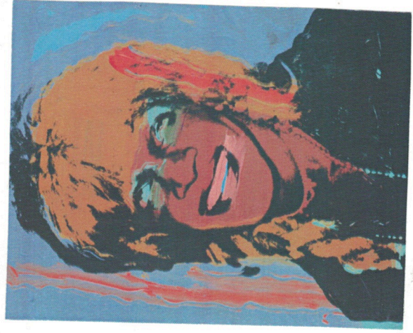
SCREEN PRINT BY ANDY WARHOL

THROUGHOUT HER LIFE-LONG FIGHT FOR QUEER RIGHTS, MARSHA EXPERIENCED: - DESTITUTION, + OFTEN, HOMELESSNESS - MENTAL ILLNESS, WITH REPEATED COMMITMENT TO PSYCHIATRIC INSTITUTIONS - DRUG ABUSE - HIV - OVER 100 ARRESTS + 1 SHOOTING, FOR PROSTITUTION - ARBITRARY POLICE ENFORCEMENT, IN PERSECUTION OF GAY PEOPLE